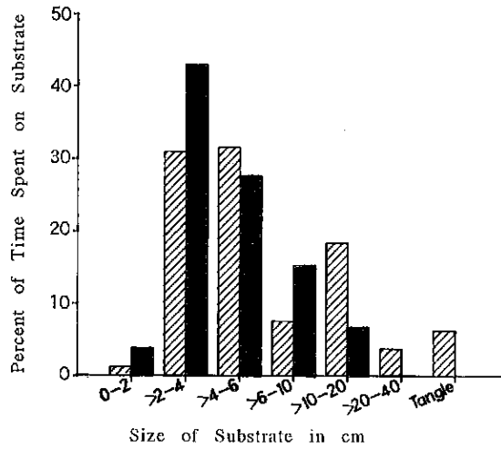
Fig. 1a. Comparison of substrate diameter differences between high and low ranking peripheral feeding males. N=158 for high ranking males, 105 for low ranking males. Note that the distribution of substrate diameter usage is very similar for high and low ranking males when they are solitary. : High rank; : low rank.